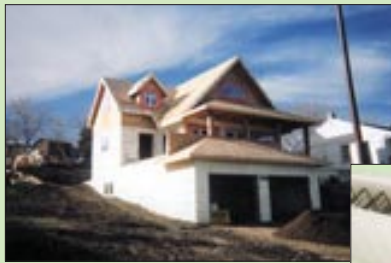
Advantage ICF Block